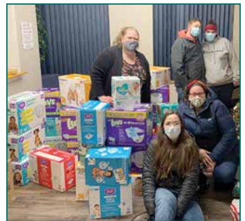
Thank you Life Church of Manchester for such a generous donation of diapers and other necessities!

As Executive Director, I will do my best, with God's help, to continue the amazing legacy for life that Real Options has had in New Hampshire's two biggest cities of Manchester and Nashua for 36 years. How many lives have been impacted and saved because of you and your dedication to God and this ministry? Only our Heavenly Father truly knows. Thank you for showing me your heart for Real Options and ultimately the clients we serve. The love you have expressed, not only in words, but in deeds, has truly been inspiring!