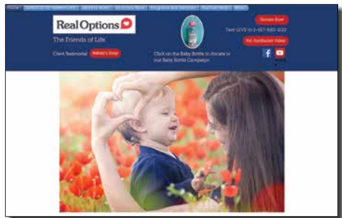
Our Donor Website • www.TheFriendsofLife.org

We are so excited to show you a glimpse of our new client website!