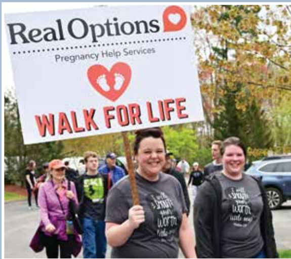
Happy Walkers from the Walk for Life 2021